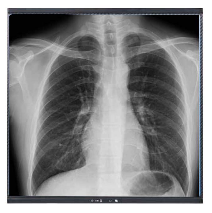
17 x 17" FPD